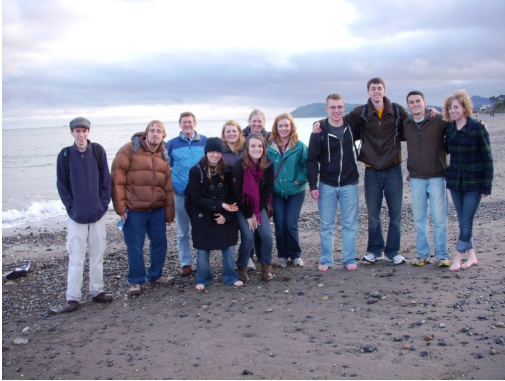
Killiney Beach, Ireland

This Spring 2012, twenty-five Loras College students and one Loras professor are studying and living abroad in seven cities within six different countries – England, India, Ireland, South Africa, Spain, and Thailand! Study abroad fosters student intellectual and personal development, challenges perspectives in many rewarding ways, and looks great to potential